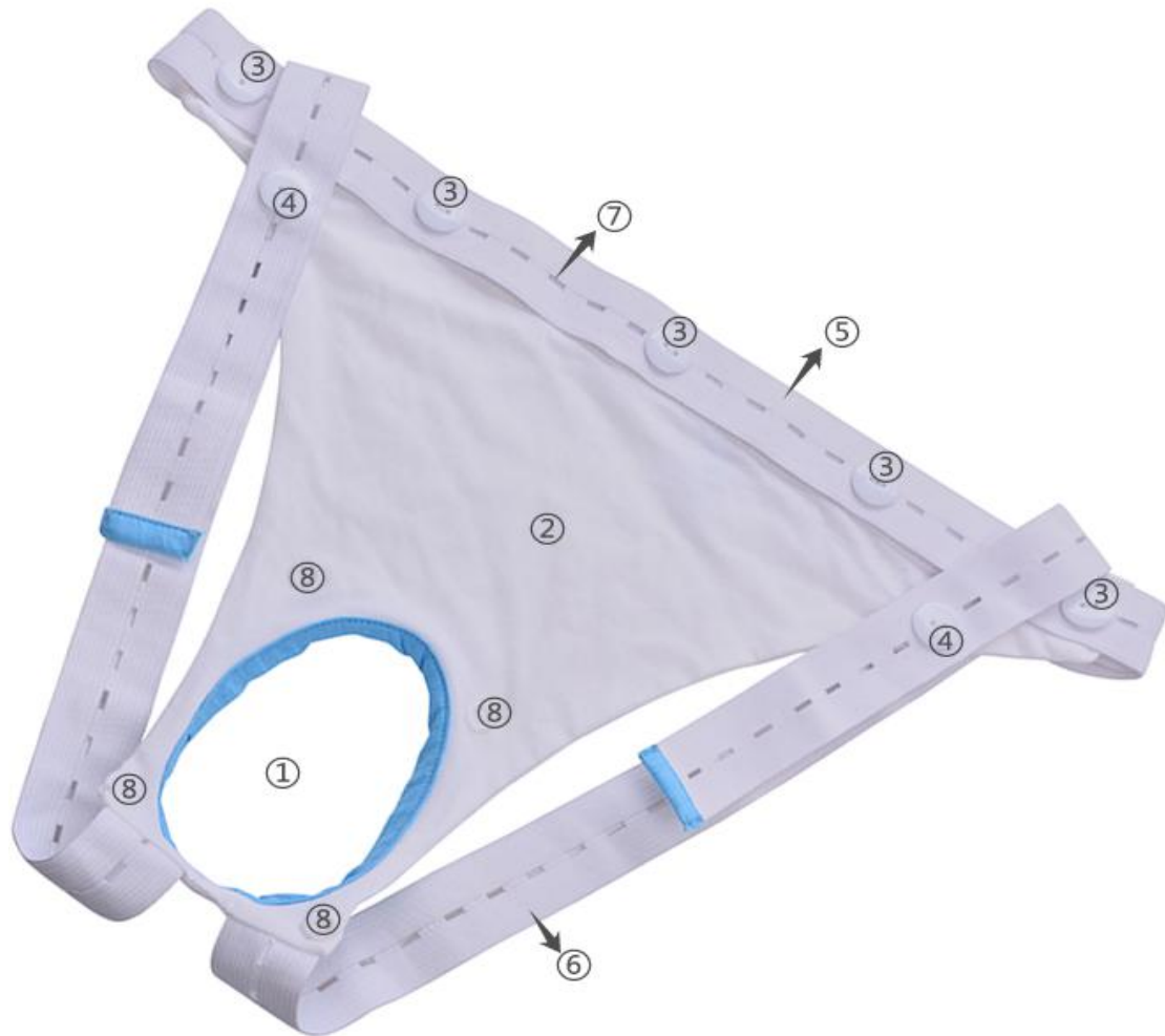
Figure 3 Female