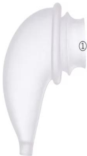
Figure 4 Male