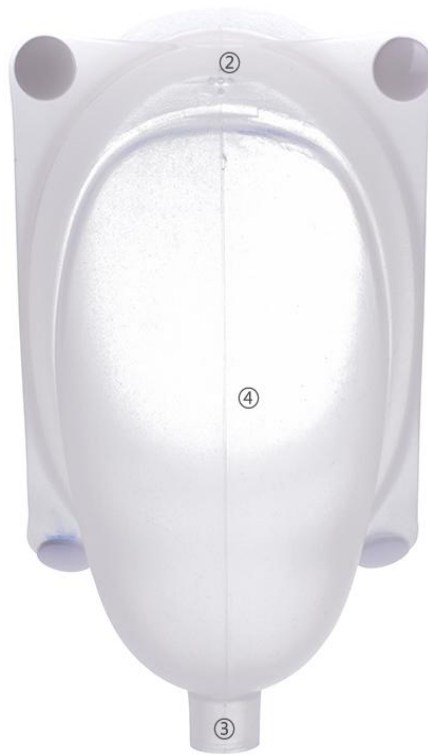
Figure 5 Female